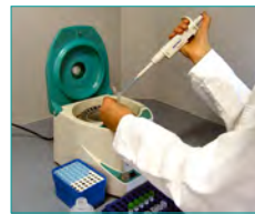
3. Cell lysis (2 ml sample, 13.000 rpm; 37°C, 45-60 min)