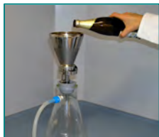
1. Sample filtration (100 – 1000 ml, 15 min)