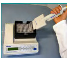
5. Immobilisation (Binding of the "sandwiches" to the binding plate, 15 min)