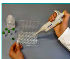
4. HybriScan® test solution (Forming of "sandwich complexes" between specific probes an the sample , 15 min)