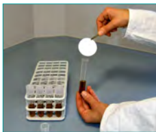
2. Enrichment culture, optional (NBB-media, 24h)