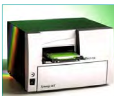
8. Signal read out (Colour reaction and signal read out, 20 min)