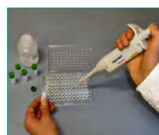
6. Enzyme coupling (Coupling of an enzyme to the "sandwiches", 25 min)