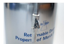
Outlet valve, vertical position: open