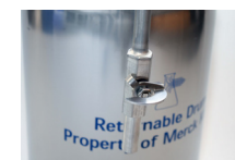
Outlet valve, horizontal position: closed