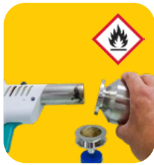
Flaming funnel base and inside