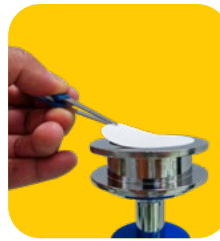
Placing filter on manifold head