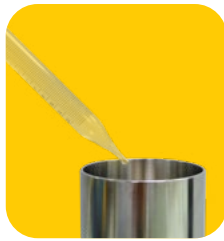
Cooling time with sterile water