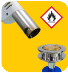
Flaming manifold head

Be careful when installing the funnel on the manifold, you might clip your fingers.