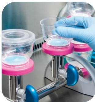
EZ-Fit® Filtration Unit set-up