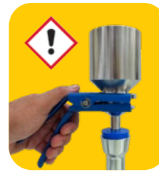
Installing filter funnel on manifold