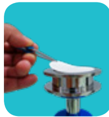
Placing filter on manifold head