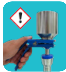
Installing filter funnel on manifold