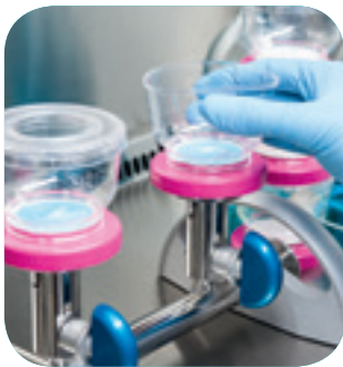
EZ-Fit® Filtration Unit set-up