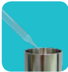
Cooling time with sterile water