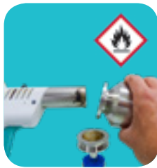
Flaming funnel base and inside