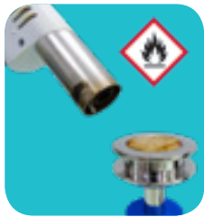
Flaming manifold head

Be careful when installing the funnel on the manifold, you might clip your fingers.