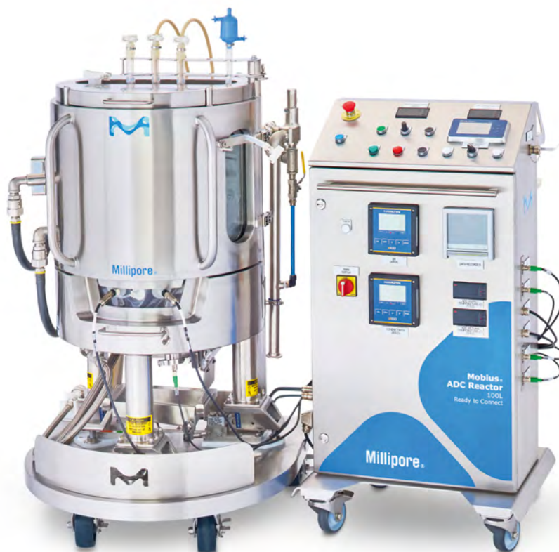
100 L Mobius® ADC Reactor with Ready to Connect Control Box.

The Mobius® ADC Reactor can be monitored and controlled locally or remotely. Plug the ready to connect control box to the network and use Ethernet IP communication protocol to monitor speed, weight, temperature, pH and conductivity remotely. The ready to connect control box is a separate box on a four wheels chassis that can be easily moved around the Mobius® ADC Reactor carrier. The 21 CFR Part 11 compliant data recorder option displays data trends in real time and ensures process data integrity when recording.