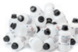
Waste of 20 × 1 L solution in PE bottles